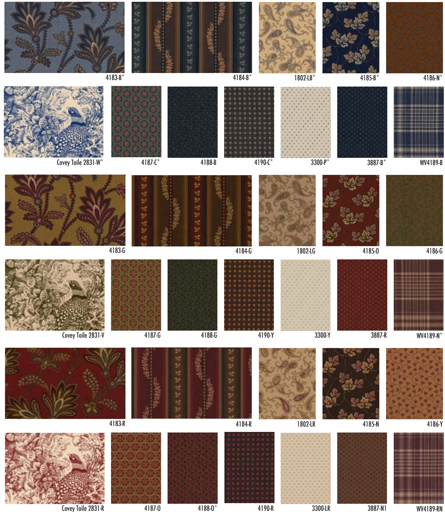
Covey Toile 2831-R